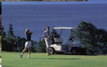
Herring Cove Golf Course

Located on the Bay of Fundy, it is a place of nature, rocky coastlines, forests, and meadows. Discover the highest tides in the world, windswept beaches, spruce and fir forests, salt marshes, and sphagnum bogs. It is heaven on earth!