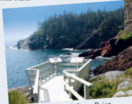
Observation Deck, Liberty Point